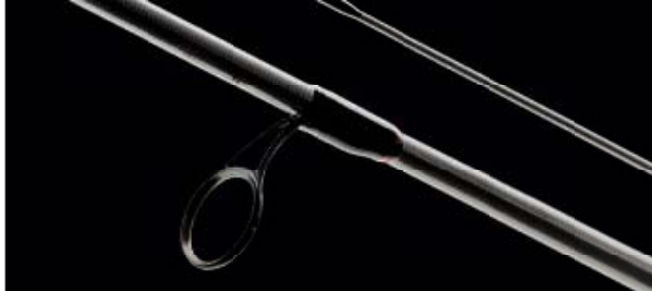
Minima black ring guides.