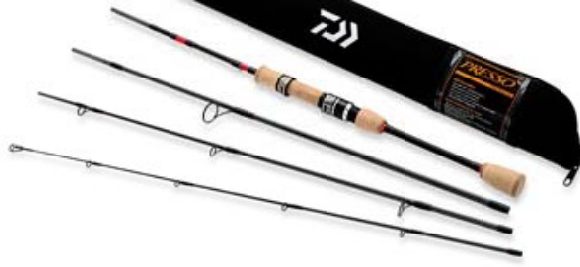
ULTRALIGHT PACK RODS Presso Four-Piece Ultralight Spinning Pack Rods.